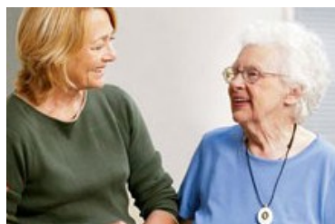
Personal Emergency Response Systems