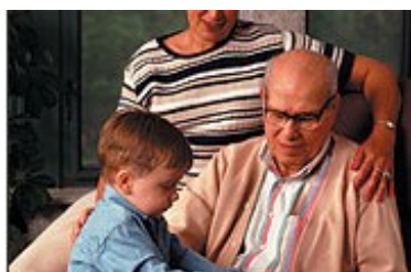
Family Caregiver Support Program (FCSP)