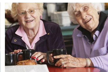
Senior Center Meals