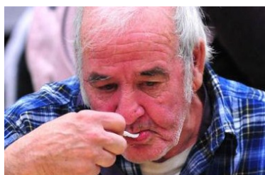
Home Delivered Meals